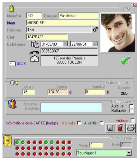
Exemple de fiche « usager »

A version called SARWIN is available to connect to the network access control. Using this system, the lock is connected to Sarwin software in real time by a RF network (see Sarwin software datasheet).