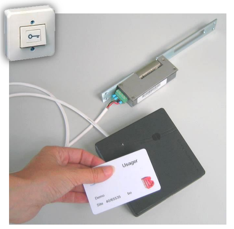
Electrical lock connected to the card reader

Reader using contactless smartcard for electrical lock, which works by battery (self-contained)