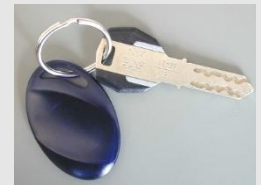
The keyfob can replace the smartcard

Technical assistance Installation and configuration Training Maintenance