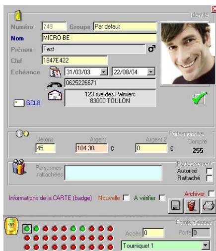
Exemple de fiche « usager »

A version called SARWIN is available to connect to the network access control. Using this system, the lock is connected to Sarwin software in real time by a RF network (see Sarwin software datasheet).