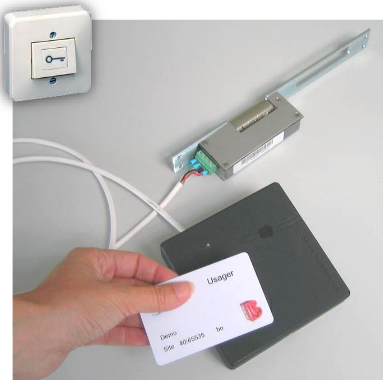
Electrical lock connected to the card reader

Reader using contactless smartcard for electrical lock, which works by battery (self-contained)